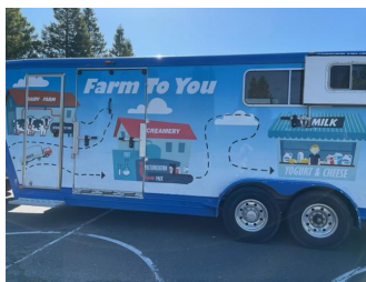
Farm Fresh to You

Buttercup the dairy cow and Marshmallow the calf visited our campus for the TK - 4th grade assembly on Tuesday. This is such an important assembly to share with our students regarding where dairy products come from. So many of our students believe that food comes from the grocery store. Many students are not aware that California produces food not only for California, but also for most of the United States.